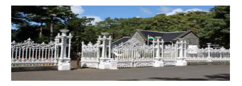
Visit of giant water lilies