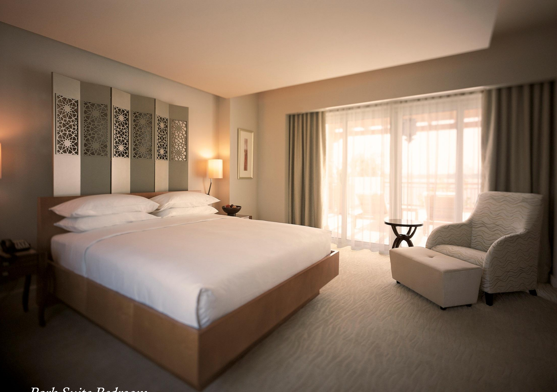
Park Suite Bedroom