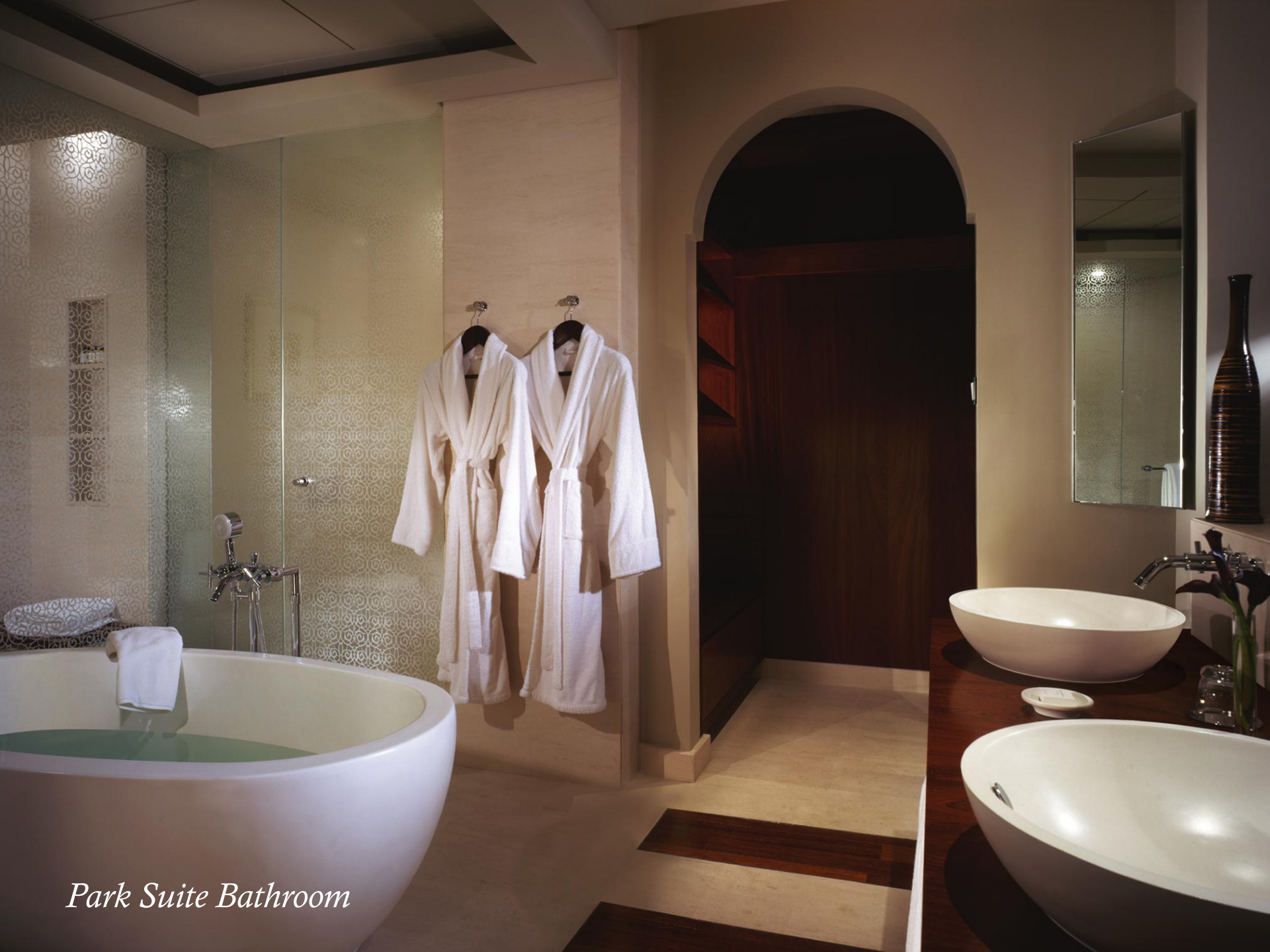
Park Suite Bathroom