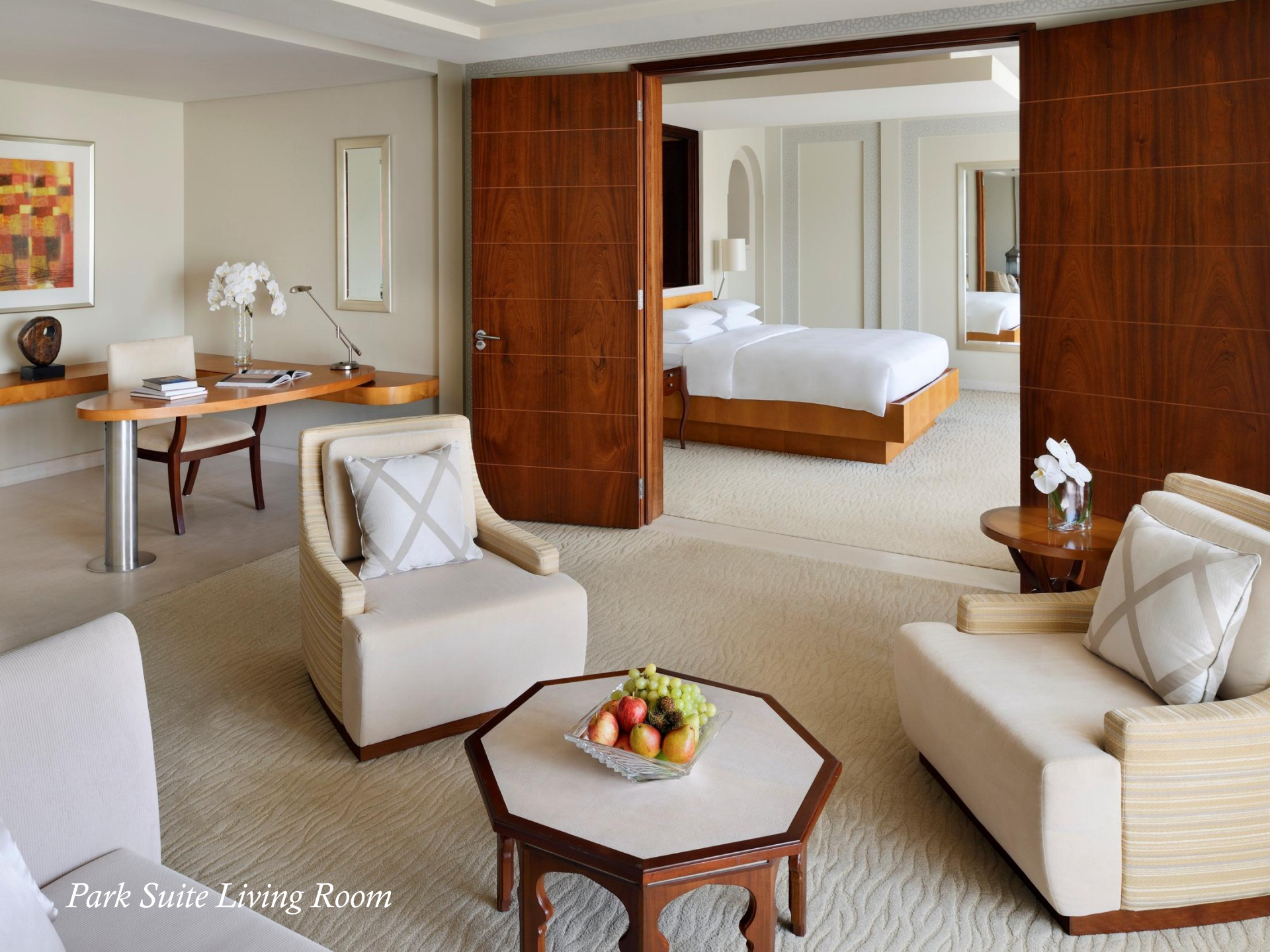
Park Suite Living Room